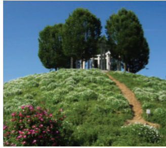
Monopteros in the Landscape Garden

The Exotic Garden is the oldest part of the garden and originated in the English Garden from 1776 to 1793, the "Dörfle". Under King William I of Württemberg, the garden was used as an exotic state tree nursery and orchard. From 1919 onwards, under the direction of the Horticulture School, the garden was re-designed into its original form of the English Garden and arboretum.