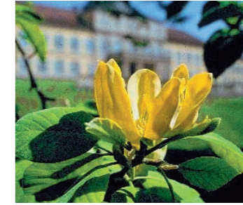
Magnolia in front of the Palace