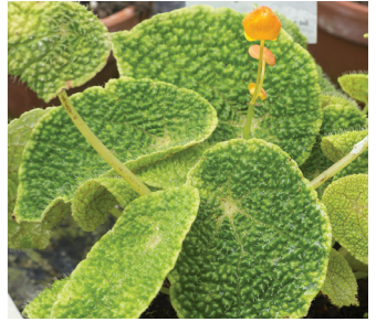
Begonia in the Collection Greenhouse

Today's Palace Park arose from the Old Botanical Garden that was created starting in 1829. In half-circle arcs, 360 species of trees from North America and Europe are displayed on an area of around 4.3 hectares on the south side of the Palace. If you go through the Palace Park and along Poplar Avenue, past the experimental vineyard and the sheep pasture toward the south, you will reach the Botanical Garden's section of vegetation history.