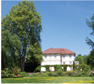
Spielhaus with a sycamore